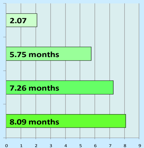
Reading Age Gain in Months